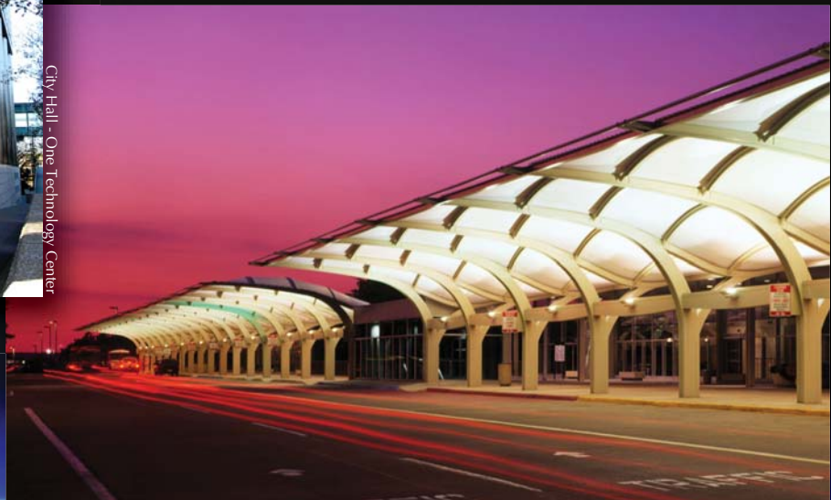
Tulsa International Airport