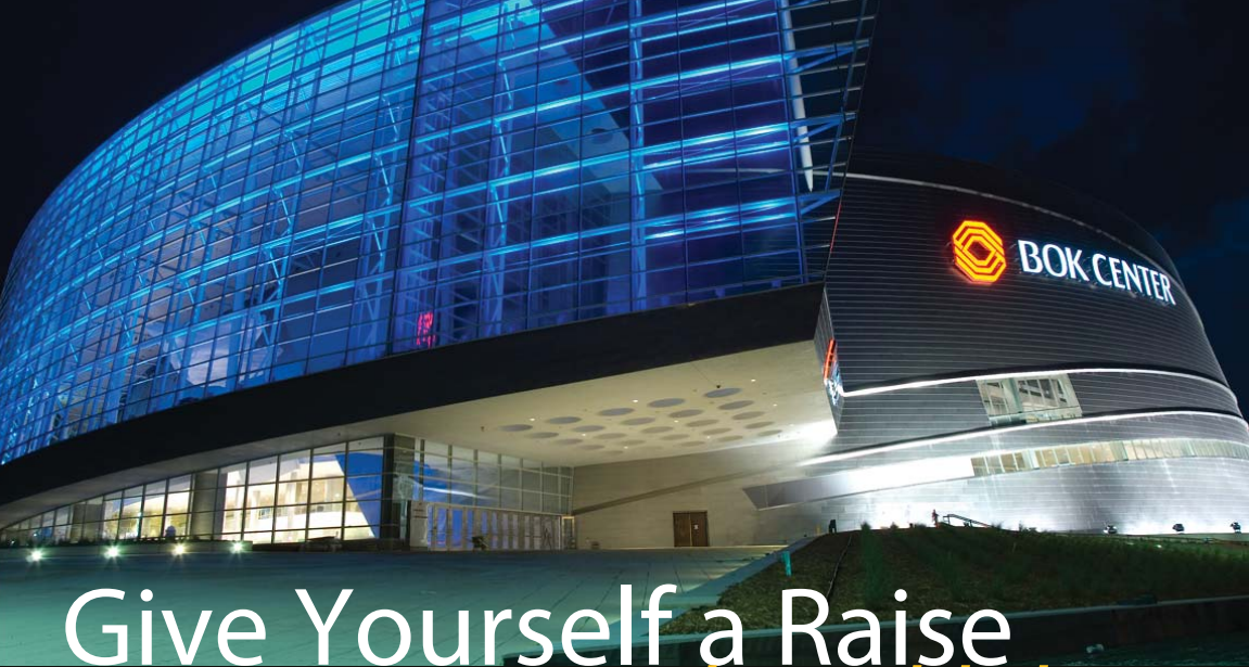
Tulsa Arena - BOK Center