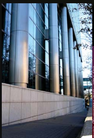
City Hall - One Technology Center

Tulsa is competitive for national sports tournaments and offers a second arena, plus a conference center and ballroom in the Maxwell Convention Center, now under renovation and due for completion in 2009.