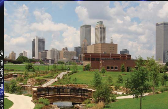
Central Center at Centennial Park

➤ Host city to the Professional Golf Association and Ladies Professional Golf Association majors, the Big 12 Conference, Conference USA, NBA and NCAA games.